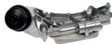
918-432 Engine Oil Temperature Cooler

Buick 2019-16, Chevrolet 2020-08, Pontiac 2010-07, Saturn 2009-08