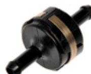
47289 Power Steering Filter Universal

Chrysler 2016-05, Dodge 2020-05, Ram 2021-14