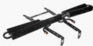
918-290 Transmission Fluid Cooler Chevrolet 2020-03, GMC 2020-03