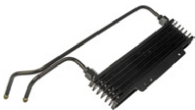
918-228 Transmission Oil Cooler

Chrysler 2000-97, Dodge 2000-97, Plymouth 2000-97