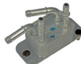
918-972 Diesel Fuel Cooler

Ford F-150 2020-11, Lincoln Mark LT 2014-11