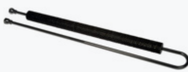
918-338 Power Steering Cooler Buick 2016-10, Cadillac 2019-13, Chevrolet 2016-13