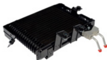
918-583 Transmission Oil Cooler

Buick 2019-16, Chevrolet 2020-08, Pontiac 2010-07, Saturn 2009-08