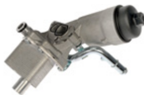
918-428 Engine Oil Cooler

Chrysler 2000-97, Dodge 2000-97, Plymouth 2000-97