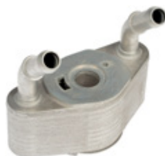
918-962 Engine Oil Cooler

Infiniti QX60 2020-14, Nissan Pathfinder 2020-13